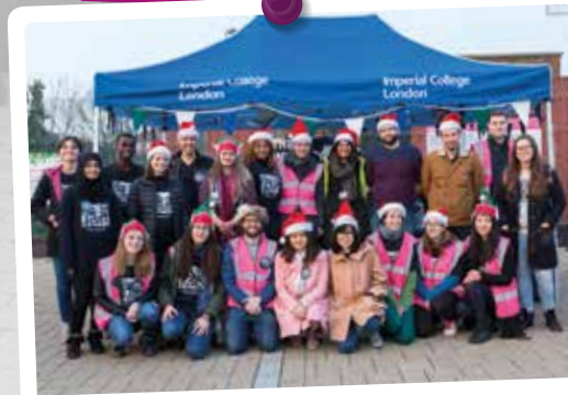
Imperial volunteers at Big Local's White City Community Christmas event