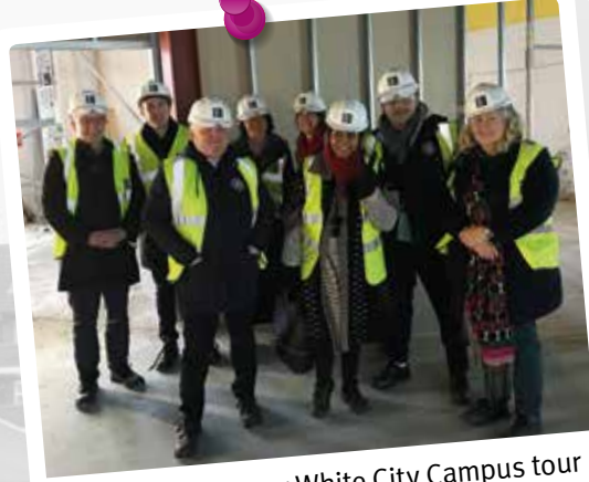
Local groups on our White City Campus tour

A urine test has been developed by Imperial medics that can tell what you've eaten. The team hopes the test will be able to track diets, and that it could even be used in weight loss programmes to monitor food intake.