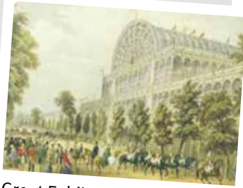
Great Exhibition at South Kensington

They both started life as international exhibition sites: