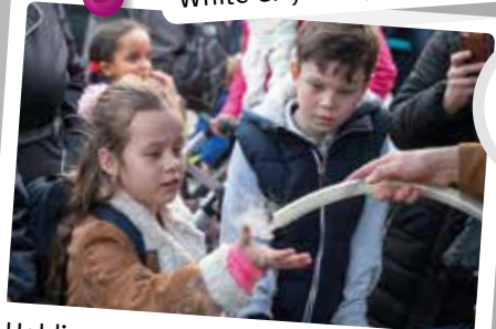
Holding a cloud at Big Local's White City Community Christmas event