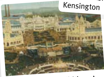
Franco-British Exhibition at White City

Imperial was founded in South Kensington in 1907 on the site of the 1851 Great Exhibition – a landmark event held in a great glass palace. Other institutions that were founded on the same site include the Science Museum, Natural History Museum, Victoria & Albert Museum, and Royal Albert Hall.