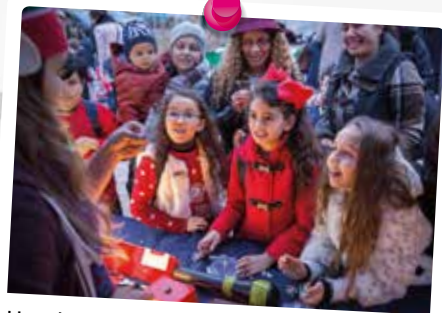
Hands-on science at Big Local's White City Community Christmas event