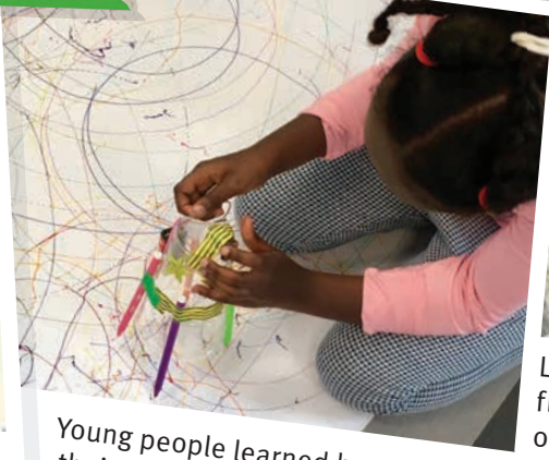
Young people learned how to make their very own scribbling robots at The Venture Centre, North Ken.