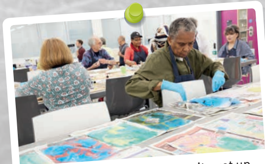
Older members of the community get up to speed with new techniques at a recent maker day at The Invention Rooms.