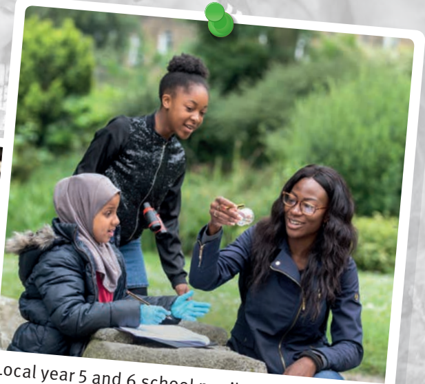
Local year 5 and 6 school pupils discover the flora and fauna of Hammersmith Park as part of the Creative Roots outreach programme.