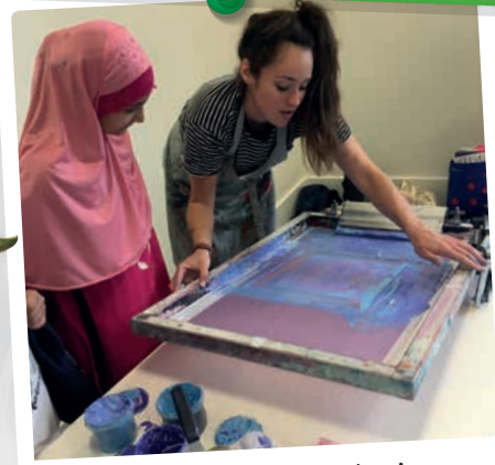
Local families see art and science collide during HF Arts Fest at The Invention Rooms.