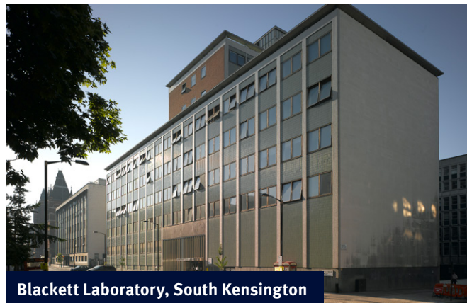
Blackett Laboratory, South Kensington