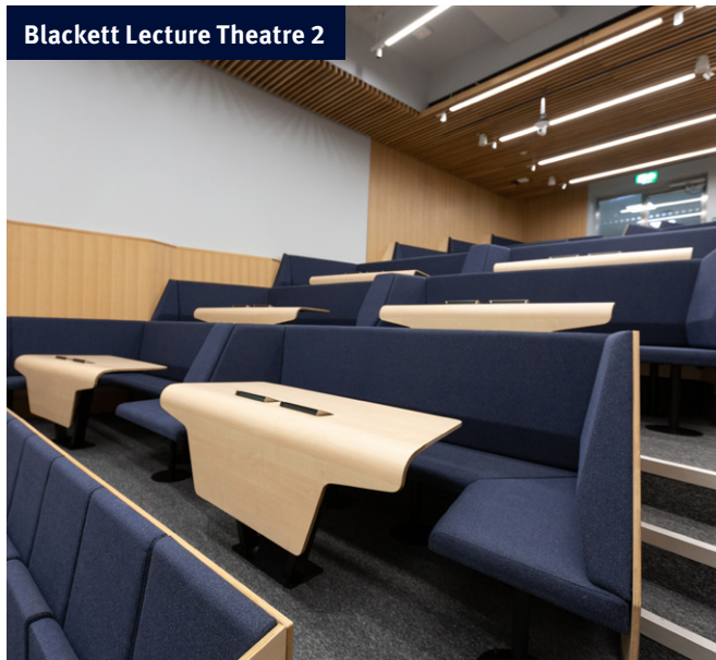
Blackett Lecture Theatre 2

Seminars are also used for developing professional skills such as making presentations and working as part of a team.