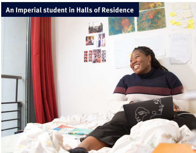
An Imperial student in Halls of Residence

www.imperial.ac.uk/study/campus-life/accommodation/prospective/ug/