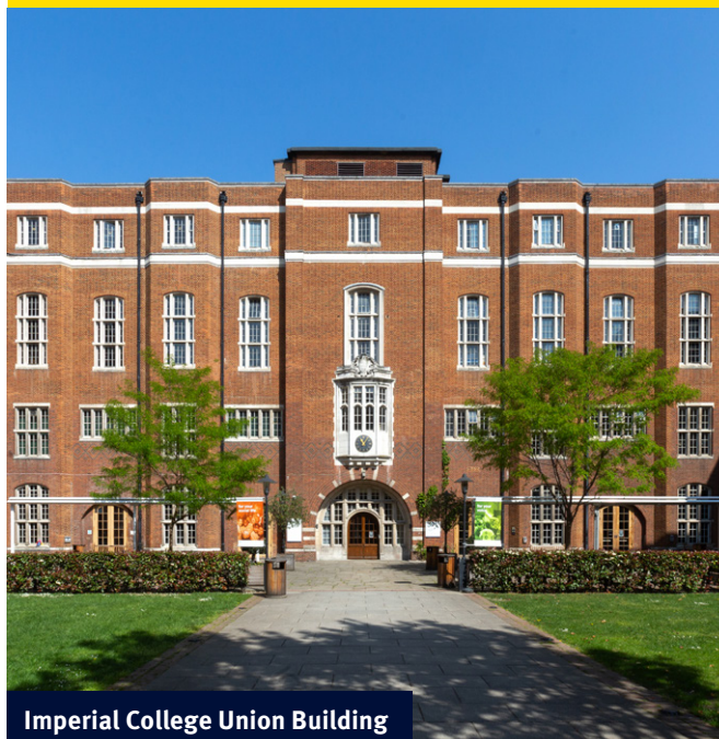
Imperial College Union Building