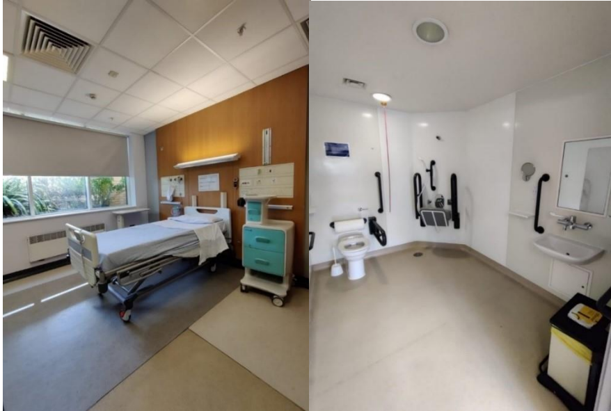
Photos of a room with en-suite bathroom at the quarantine unit.