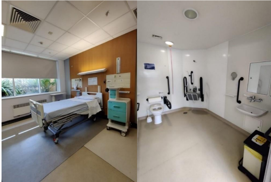
Photos of a room with en-suite bathroom at the quarantine unit.