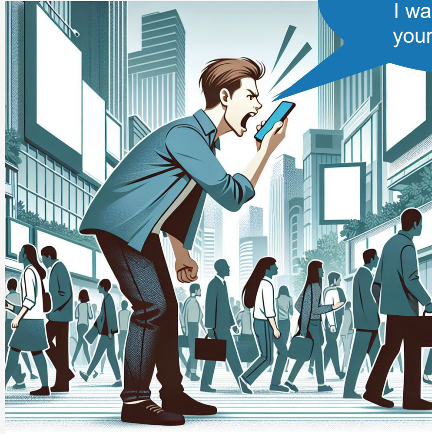
Image created by Microsoft Copilot on 17/03/2025. Description: A person shouting into a phone in a futuristic cityscape. Generated from user (HH) prompts.