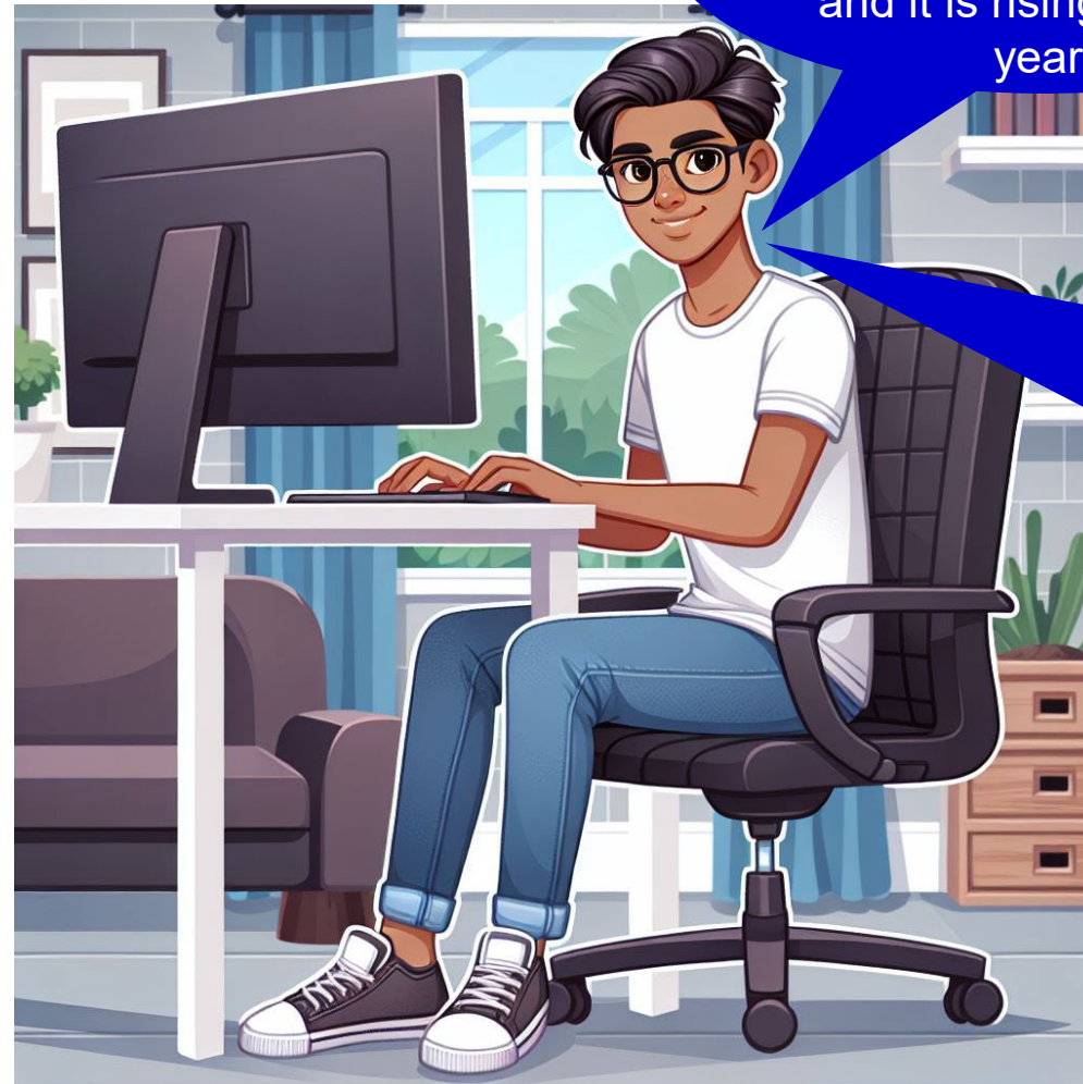
Image created by Microsoft Copilot on 21/03/2025. Description: A young man on a computer Generated from user (HH) prompts.