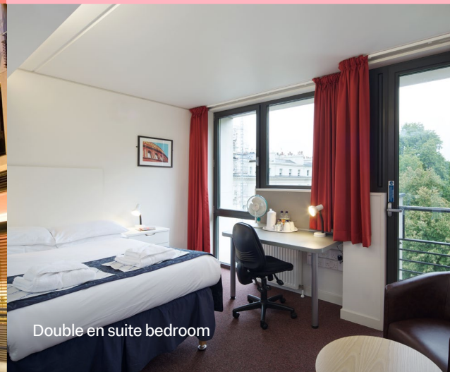
Double en suite bedroom