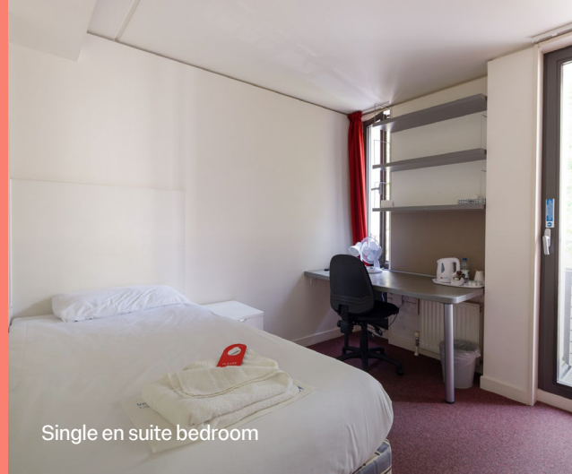
Single en suite bedroom