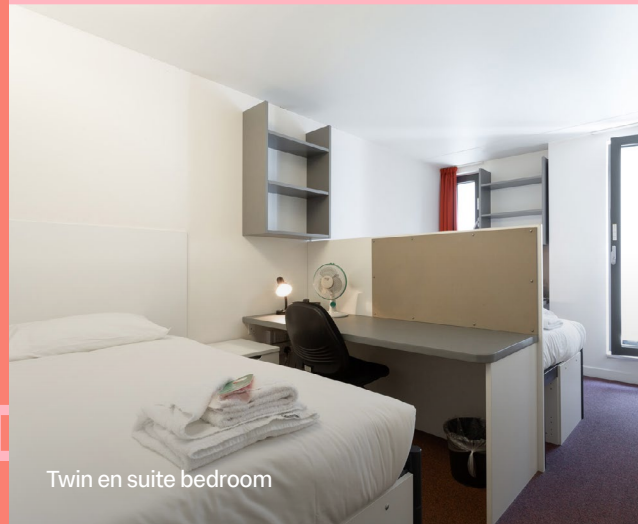
Twin en suite bedroom